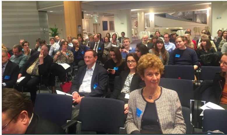
The audience at Yehudim Menuhim room